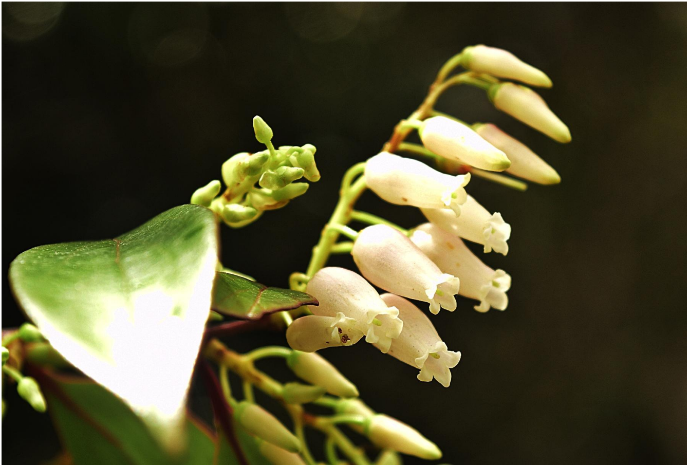
Figure 1. Inflorescences of Vaccinium carneolum.

toward the apex, 7-plinerved, usually outer two very close to the margin, few upper nerves often arisen from the midrib, faintly raised on both sides, reticulation slightly raised on both surfaces; petioles red, 7–9 mm long by 0.8–1.1 mm wide. Inflorescence racemes, borne from the upper 3 to 6 upper axils, suberect or spreading, bearing about 16 to 18 flowers, rachis glabrous, rather slender, eperulate at anthesis, 2.8–3.5 cm long, eperulate at anthesis. Pedicels slender, 6 mm, usually with few glandular or clavate glands especially at the apex, bracteoles not seen. Calyx campanulate, base truncate, clad with glands at the base, upward glabrous, limb deeply 5-lobed, ovate, apex rounded or obtuse, sometimes acute, apical gland conspicuous, dorsal surfaces glabrous, margin densely ciliate. Corolla glabrous on both sides, elongate, c. 9 mm long, c. 3 mm wide, white or greenish white, slightly pinkish at the base, tube